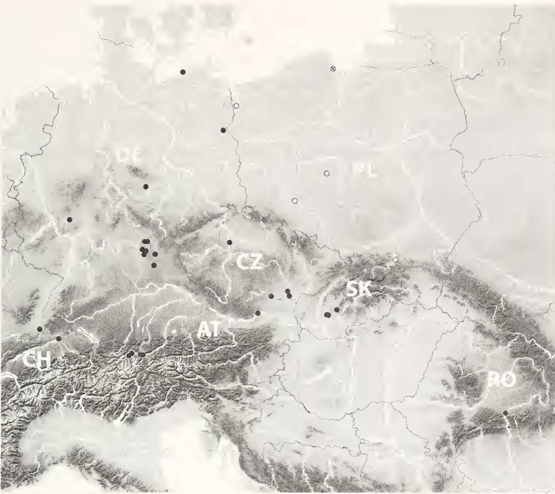
Fig. 3: Distribution map of H. dahli . Occurrences with localities (black dots on the sampling site) and without localities (white dots on the capital city of the corresponding region). MENGE's (1869: 232) locality of the nomen dubium Microneta pusilla (X).

bendem Buschwerk, zum Teil in verfallenen Weingärten. Sehr mildes Klima"], leg. H. Malicky, det. J. Wunderlich.